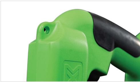
Harness / tether hole